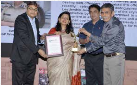
Swati Lakra, IGP, Telangana