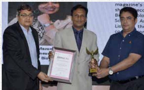
Award presented on behalf of Kiran Mazumdar Shaw, Biocon