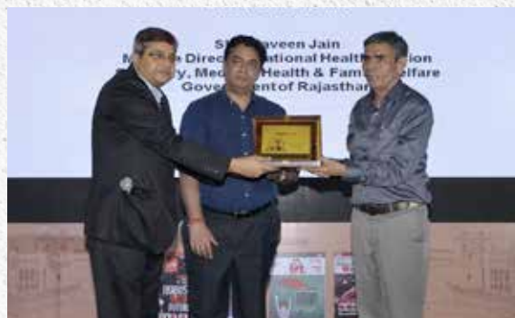
Award presented on behalf of Saina Nehwal, Indian Badminton Player