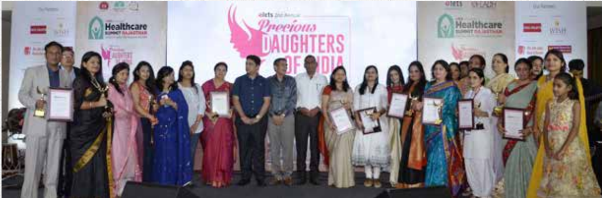
Precious Daughter of India awardees during a group photo-op