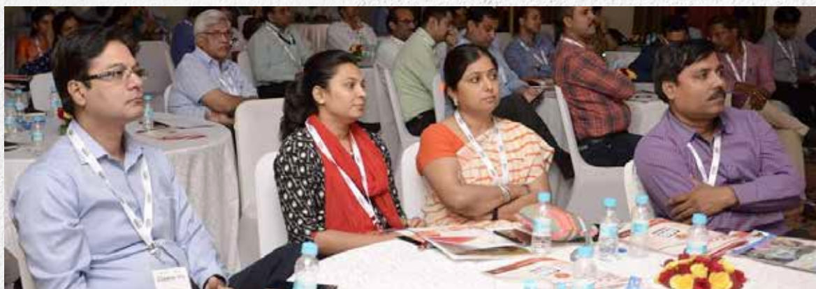
Delegates at Elets 4th Annual Healthcare Summit Rajasthan

We have partnered with baby centers to launch m-Mitra which is training or giving advice to pregnant women. These are voice-based calls meant for women in rural areas, to tell them about the phases of pregnancies and precautions that needs to be taken during that time. We have MoU with the Government of Maharashtra and NIPER. We also worked with the Central Government for the eradication and supply of medicines for TB. We recently started institute on wheels which helps to train healthcare professionals in rural areas.